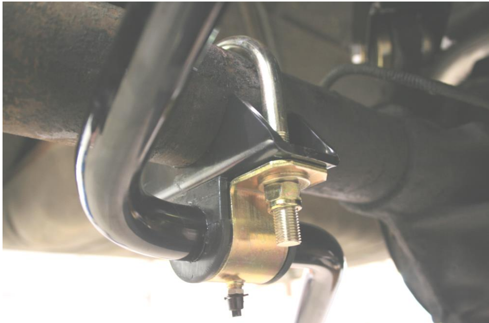
Figure 4 – Sway Bar Mounted on Rear Axle