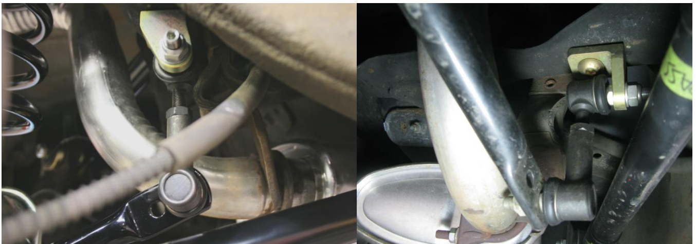
Figure 2 - Upper Mounting Bracket Orientation (Passenger Side Shown)