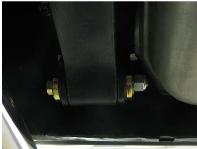
Figure 2 – Rear Leaf Spring Shackles Installed