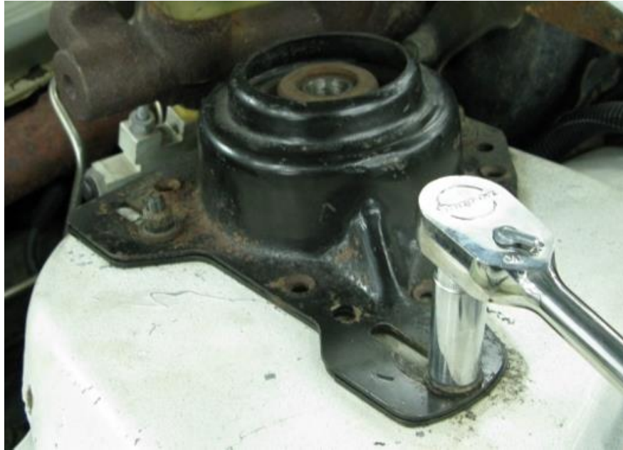
Figure 2 – Remove the Upper Strut Mount Assembly