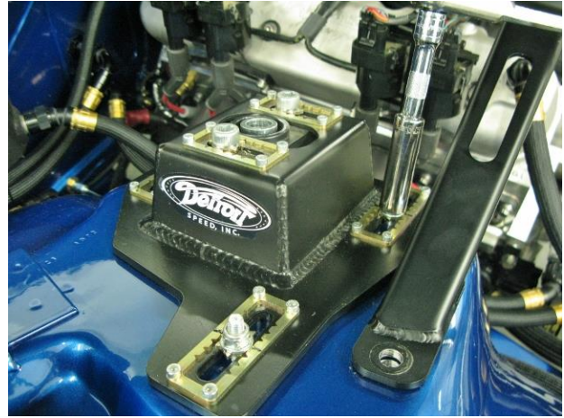
Figure 4 – Install Strut Mount Assembly (Detroit Speed Kit Shown)