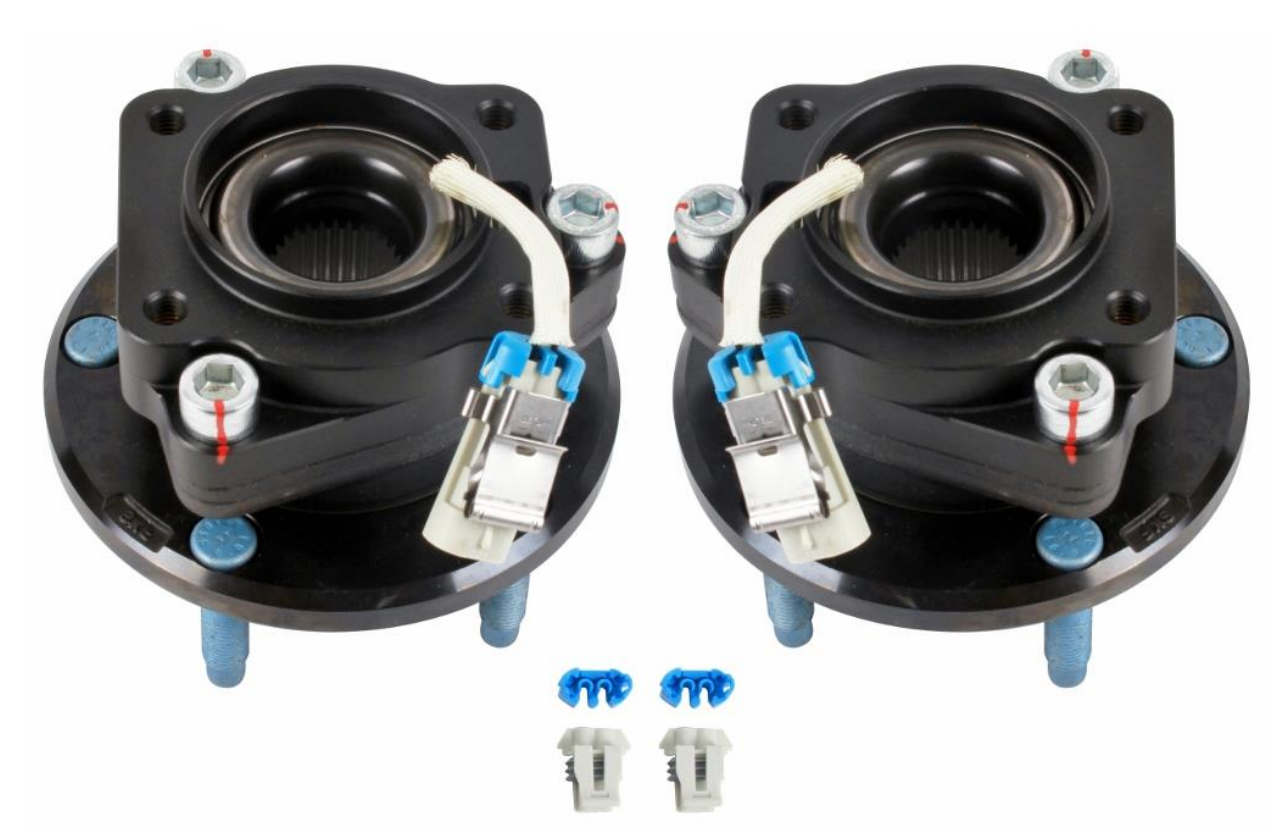
Figure 1 - P/N: 030601

The Detroit Speed Inc., X-Tracker Hub Adapter Kit uses heat treated alloy steel adapters to allow the use of SKF Racing X-Tracker hubs on the factory 1993-2002 Camaro/Firebird and 1991-96 Corvette spindle. The use of high performance hubs results in improved hub stiffness and performance, reduced brake caliper piston knock-back as well as improved hub durability. The kit is 100% bolt-on system that includes all required mounting hardware and electrical connectors. The wheel hub remains in the factory location and does not affect wheel offset or brake system compatibility as well as retains full functionality of the ABS system.