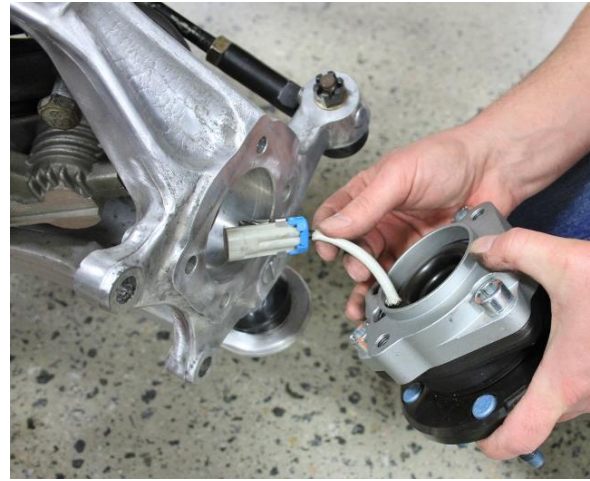
Figure 4 - Position Detroit Speed X-Tracker Hub Assembly (1991-96 Corvette)

Apply Red Loctite 272 onto the threads of the provided M10-1.5 socket head cap screws. Install the M10 fasteners with the provided M10 washers through the spindles and into the hub adapters. Torque to 70 ft.-lbs. (Figure 5). If installing P/N: 030602, skip to Step 9.