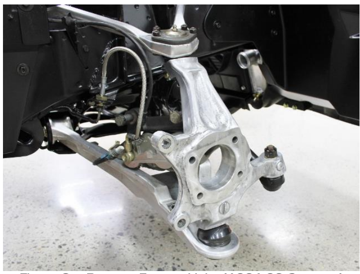
Figure 3 - Remove Factory Hubs (1991-96 Corvette)

4. Remove the front hubs from the spindles by removing the 4 bolts holding them to the spindle (Figure 3). Clean any rust or loose dirt from the spindle where the factory hub was located.