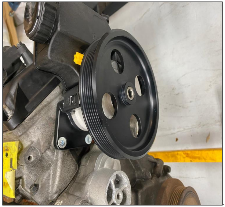
Figure 6 – 198-104/97-383 Assembly Installed onto 97-380 Adapter

Install the 198-104 Power Steering Pump/97-383 Pulley Assembly onto the previously installed 97-380 Power Steering Pump Adapter using the supplied M8 Flange Head Bolts and torque to 18 Ft. Lbs. (25 N·m).