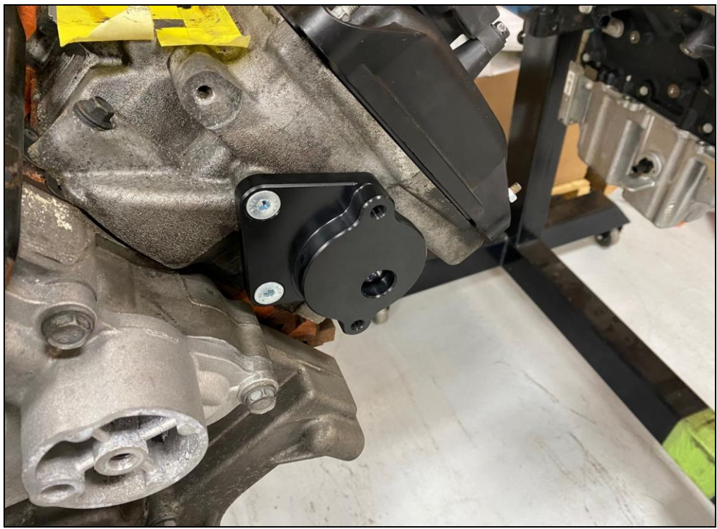
Figure 3 – 97-380 Adapter Mounting to Gen III Hemi Cylinder Head

Using the supplied countersink M8 bolts install the adapter plate to the cylinder head using a 5mm hex key or HW5 hex bit socket. Torque adapter plate to head bolts to 21 Ft. Lbs. (28 N·m). (NOTE: Apply a small amount of blue thread locker to threads).