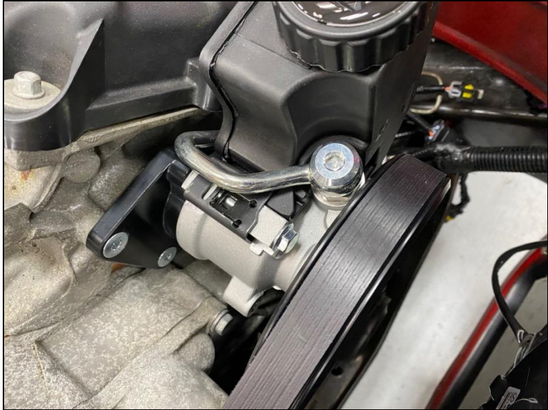
Figure 8 – Hardline Power Steering Pump Installed

7. Next, install the hardline onto the pump and torque the banjo bolt to 21 Ft. Lbs. (28 N·m).