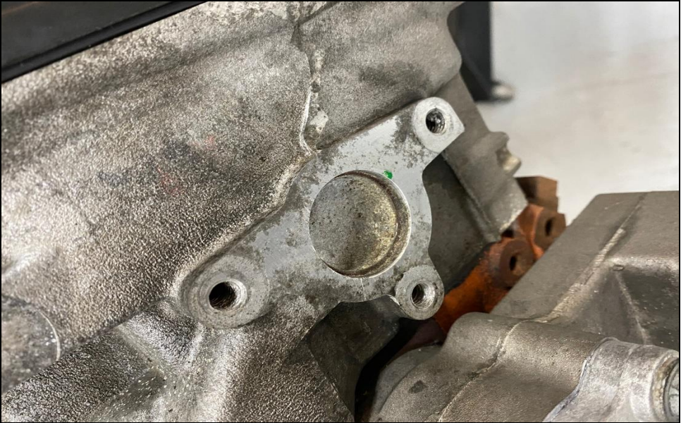
Figure 2 – Gen III Hemi Power Steering Pump Mounting Surface

3. Clean the surface of the cylinder head where the Gen III Hemi to Saginaw Type II Power Steering Adapter Plate will mount.