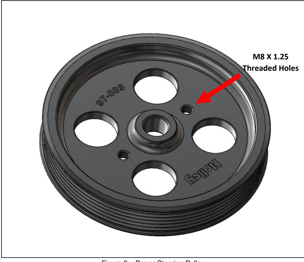
Figure 8 – Power Steering Pulley

The power steering pulley is made of aluminum to save weight, therefore standard pullers will not function correctly and will result in damage to the pulley. To remove the pulley, either use a 4 jaw puller and grab the 4 holes machined into the pulley or a steering wheel removal tool with M8 x 1.25 threads. Then push off from the center stud of the power steering pump. Do not use hammers or pry against the pump housing, otherwise damage will occur.