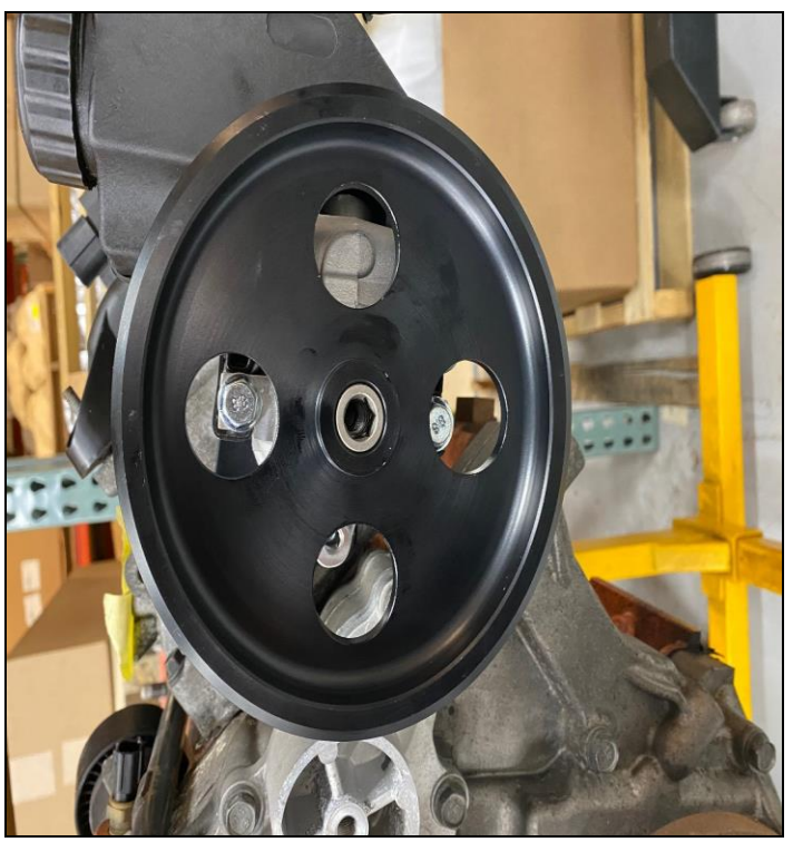
Figure 7 – 197-104 Bolt Access