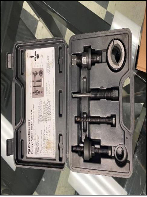
Figure 4 – Pulley Puller/Installer Kit

5. Install the 97-383 power steering pulley onto the Holley Saginaw Type II Power steering pump using a Pulley Puller/Installer Kit (See figure 3). This can be rented at most local auto parts stores. NOTE: Using a press or hammer to install the pulley will result in damage to the pump. Press the pulley onto the pump until the surface of the pulley is flush with the pump shaft (See Figure 4).