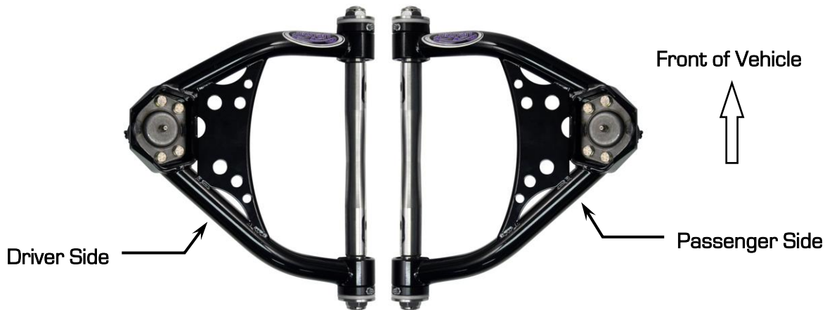
Figure 2 - LH and RH orientation