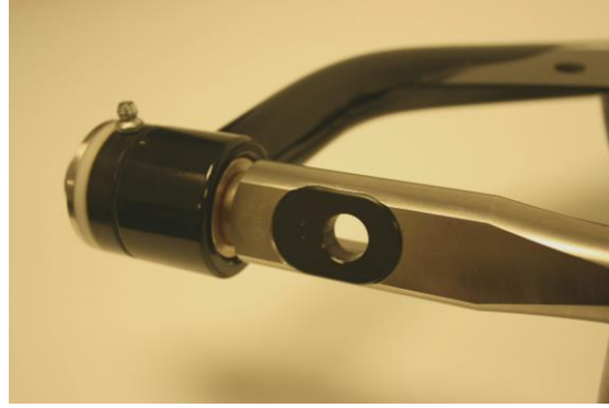
Figure 6 – Bushing Installed

Camber should be adjusted by using shims provided by the alignment shop and placed between the frame attachment and cross shaft if needed.