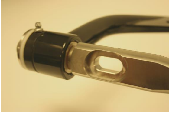
Figure 5 – Bushing Removed

Additional caster adjusters are supplied at no charge for caster adjustment if needed. Installing the caster adjuster with the attachment hole forward in the control arm will position the entire control arm rearward in car and create additional positive caster. The same adjusters can be rotated 180° for the opposite effect on caster. Finally, the second set of caster adjusters you have received (labeled "2") can be used for additional caster or can be used for minimum caster. Figure 5 below shows the bushing removed and Figure 6 shows the bushing installed.