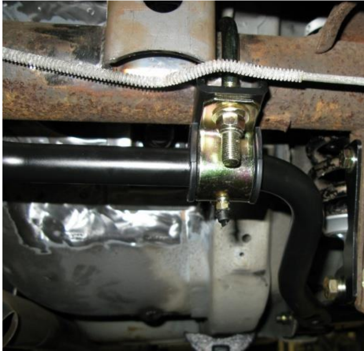
Figure 3 - Sway Bar Mounting Bracket