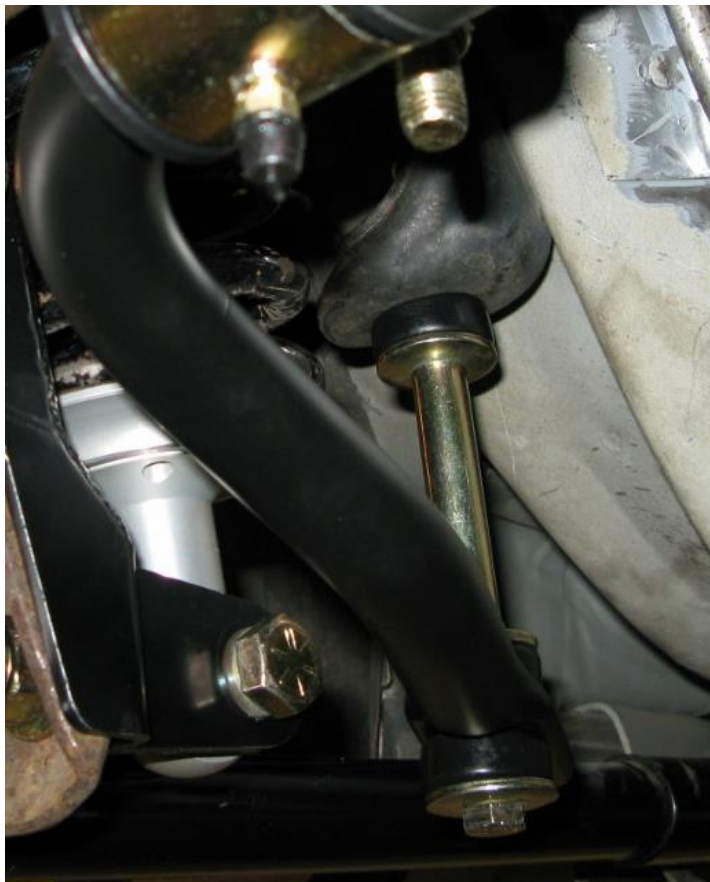
Figure 4 - Sway Bar End Links