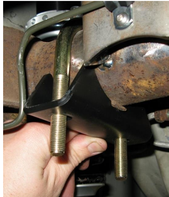
Fig. 2 - Rear Axle Clamp (P/N: 042219DS)