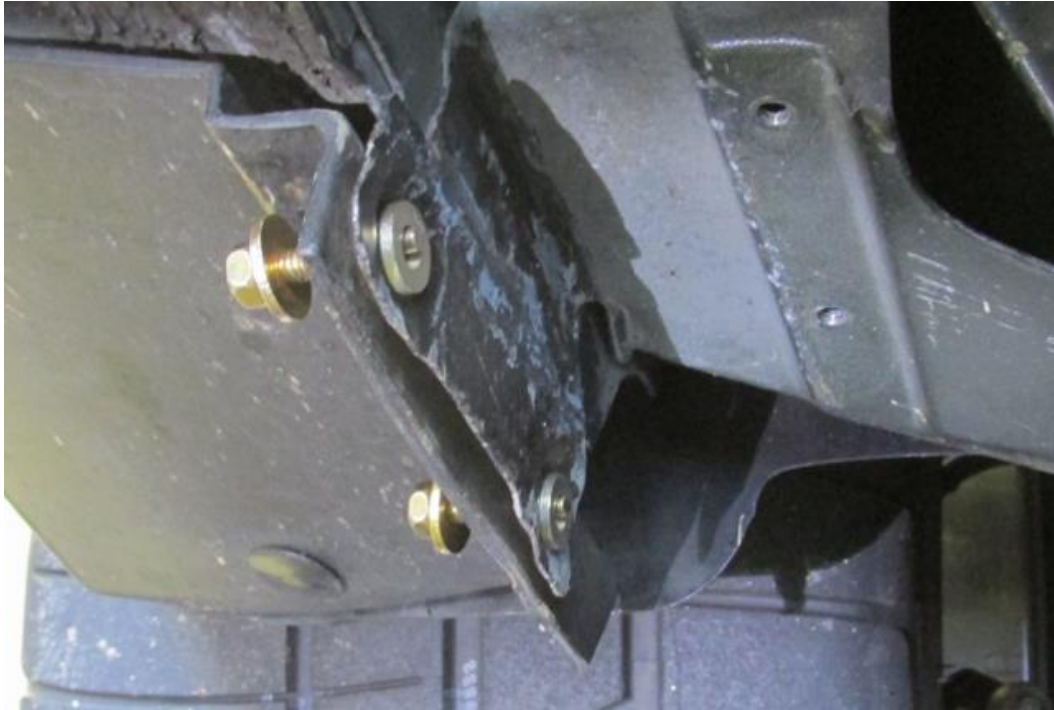
Figure 4 - Install Hardware