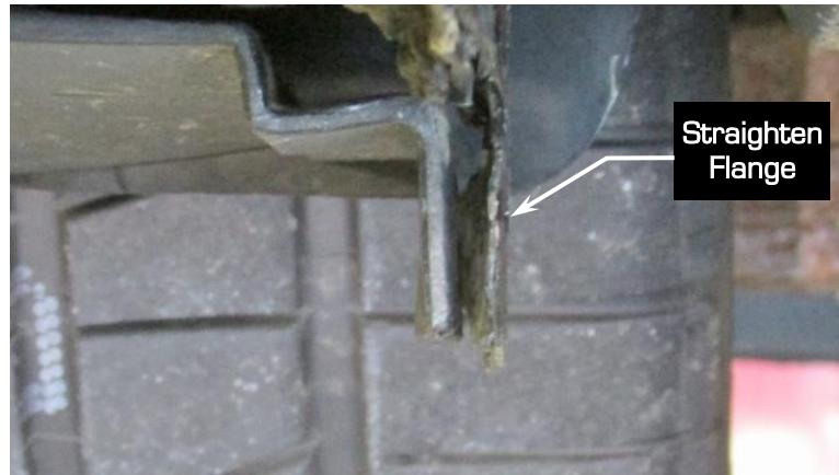
Figure 2 - Straighten Fender Flange