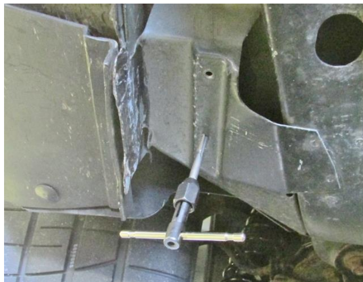
Figure 3 - Tap Framerrail Holes