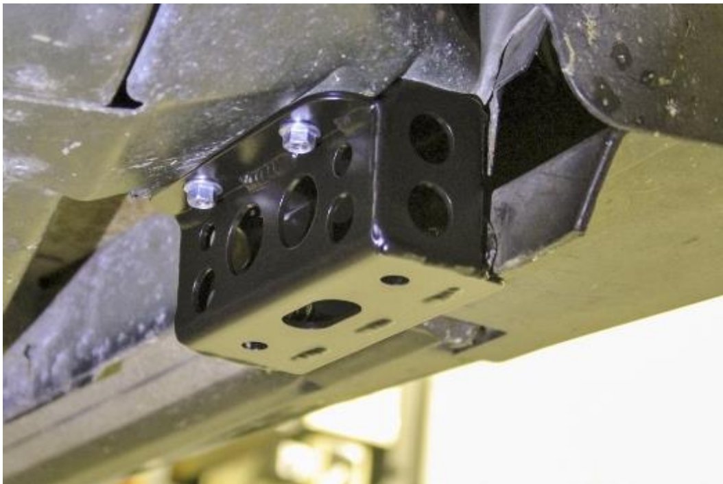
Figure 5 - Locate Fender Flange Shield