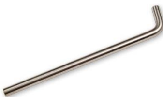
Figure 2 - Detroit Speed Spanner Tool