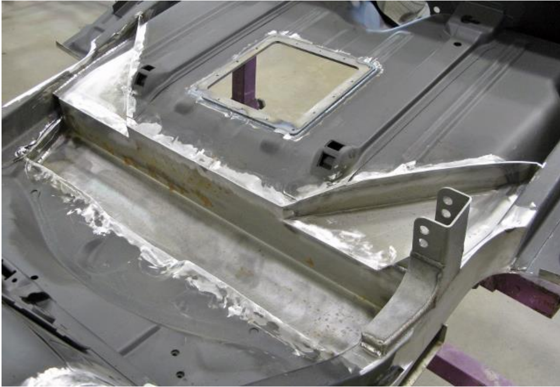
Figure 1 - Bottom Side of Trunk Closeouts