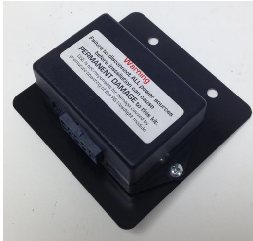
Figure 6 - Wiper Control Module & Plate