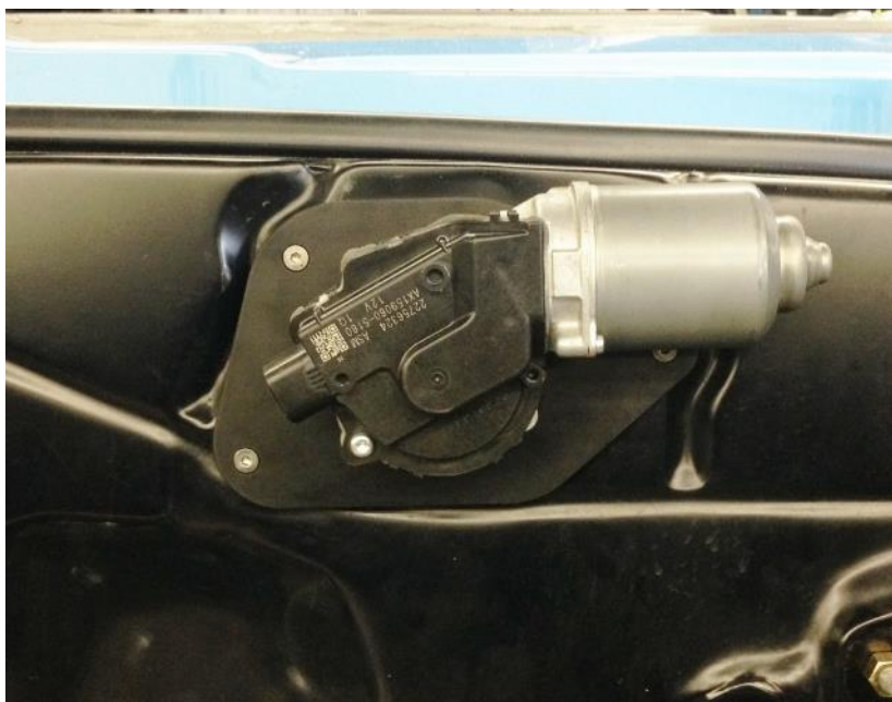
Figure 1 – Attach Wiper Motor to Firewall