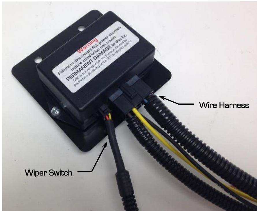
Figure 8 - Connect Wiper Switch & Harness to Module