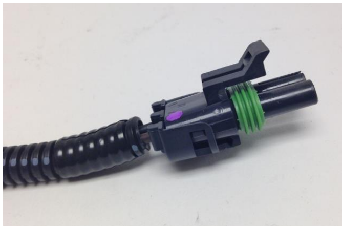
Figure 5 – Washer Pump Connection