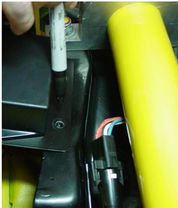
Figure 7 - Locate the Bolt Holes