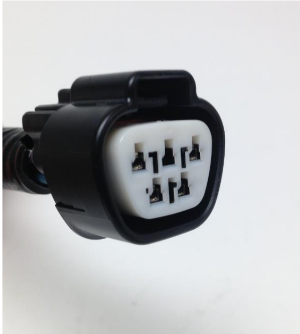
Figure 4 – Wiper Motor Connector