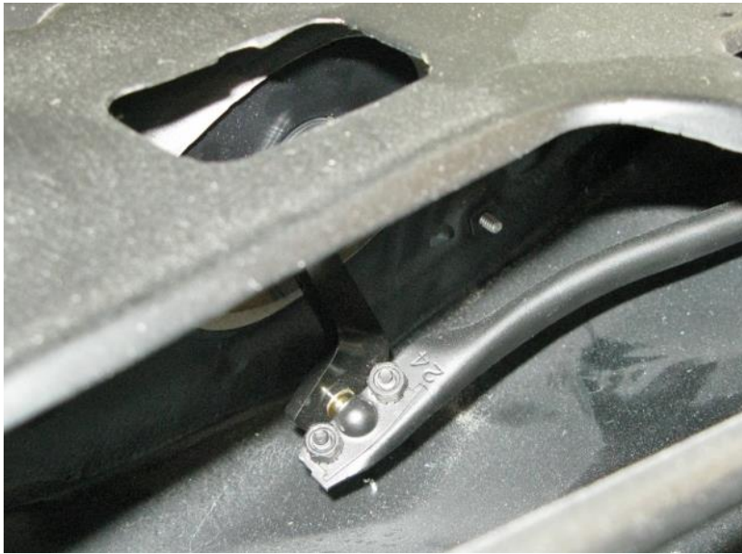
Figure 2 - Attach Pitman Arm to Wiper Linkage