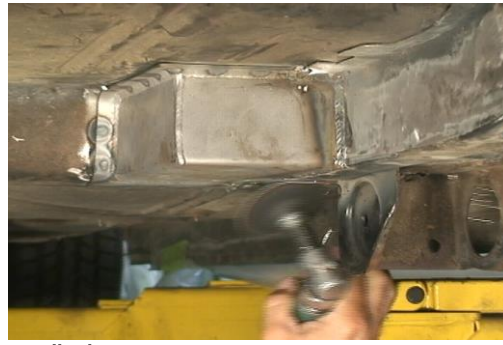
Torque Box Installation