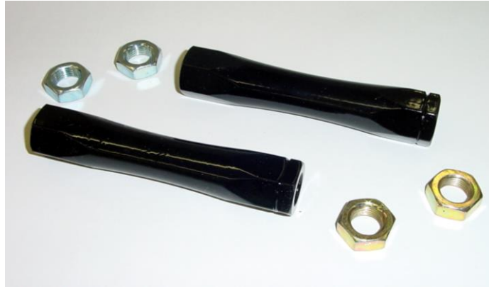
Figure 2 – Billet Tie Rod Adjusters