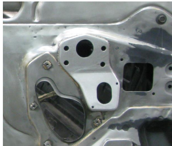
Figure 2 - Installed Bracket (1967-69 shown)