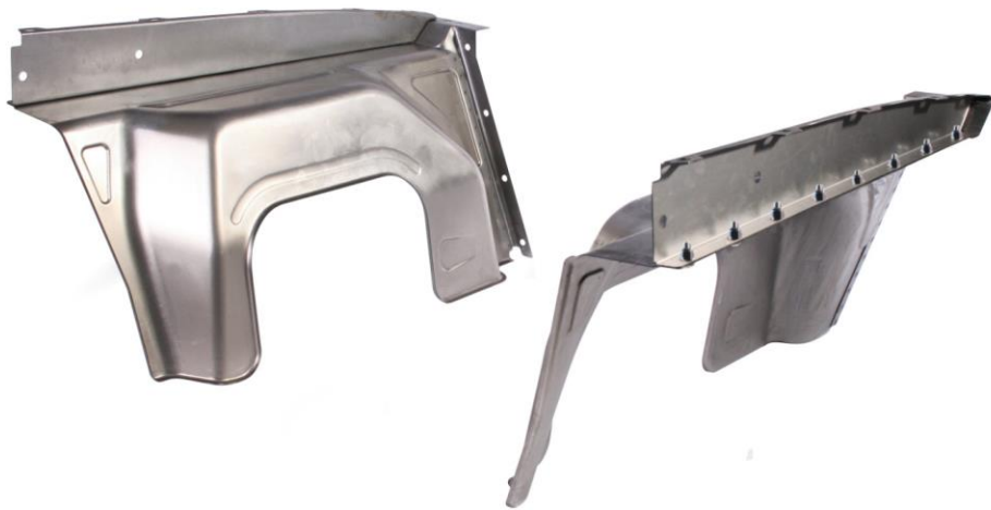
1962-1965 Chevy II Inner Fenders Shown

Detroit Speed's Chevy II inner fenders are designed to fit Chevy IIs equipped with a Detroit Speed Chevy II Front Frame. They completely hide the Front frame bay bars resulting in a neat and clean under hood appearance. The inner fenders are stamped from 18-gauge steel and are made in the USA.