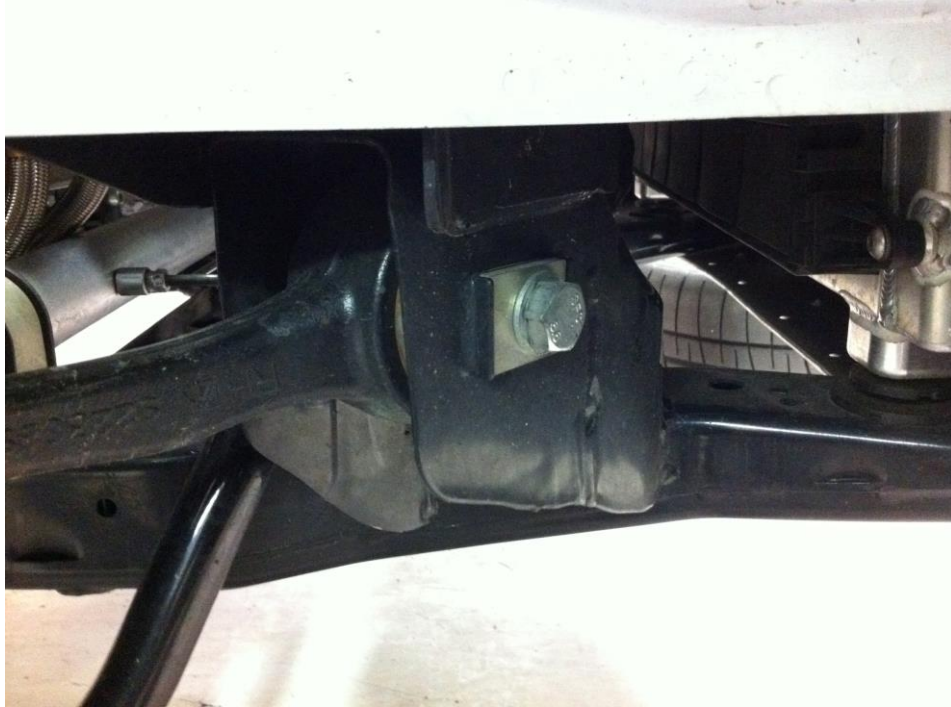
Picture shows installation on the passenger side.

Legal Disclaimer: Detroit Speed is not liable for personal, property, legal, or financial damages from the use or misuse of any product we sell. The purchaser is solely responsible for the safety and performance of these products. No warranty is expressed or implied.