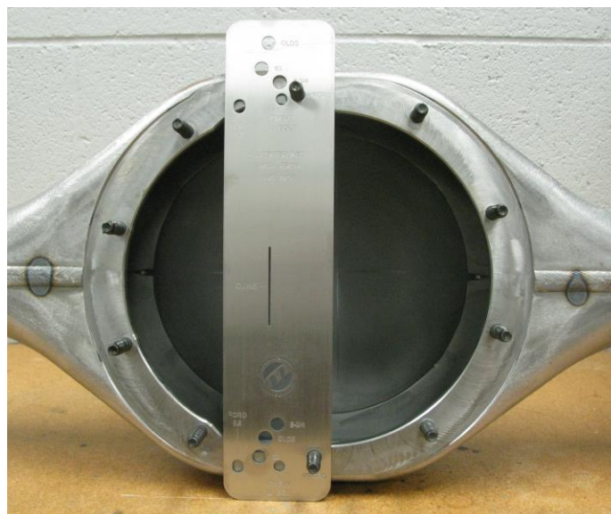
Figure 1 - Pinion Centering Tool Location