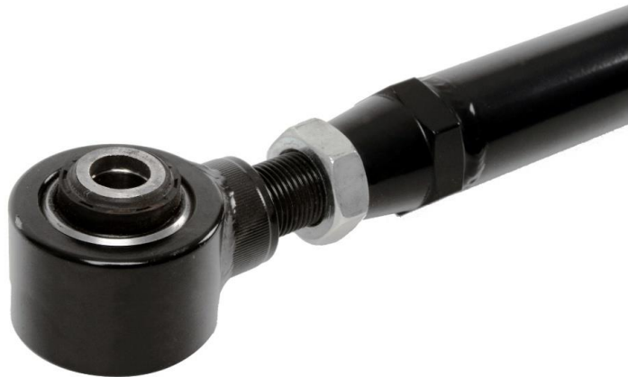
Figure 1 - Cross-Axis Pivot Bushing