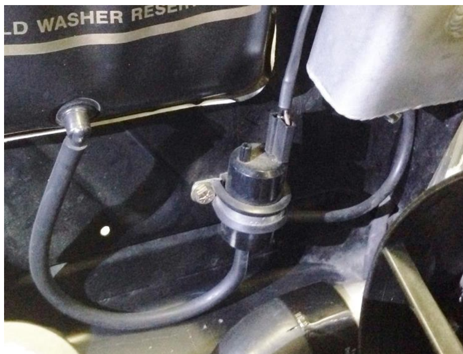
Figure 2 - Install Washer Pump