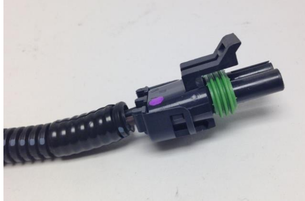
Figure 1 - Washer Pump Connection