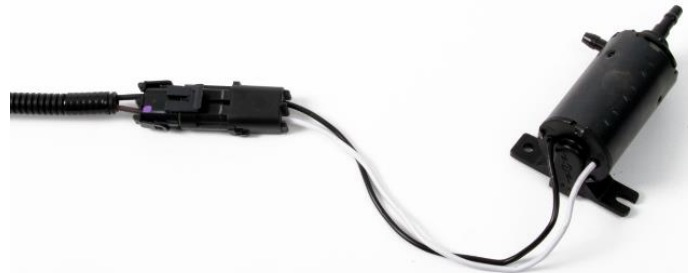
Figure 4 - Connect the Weather pack connectors