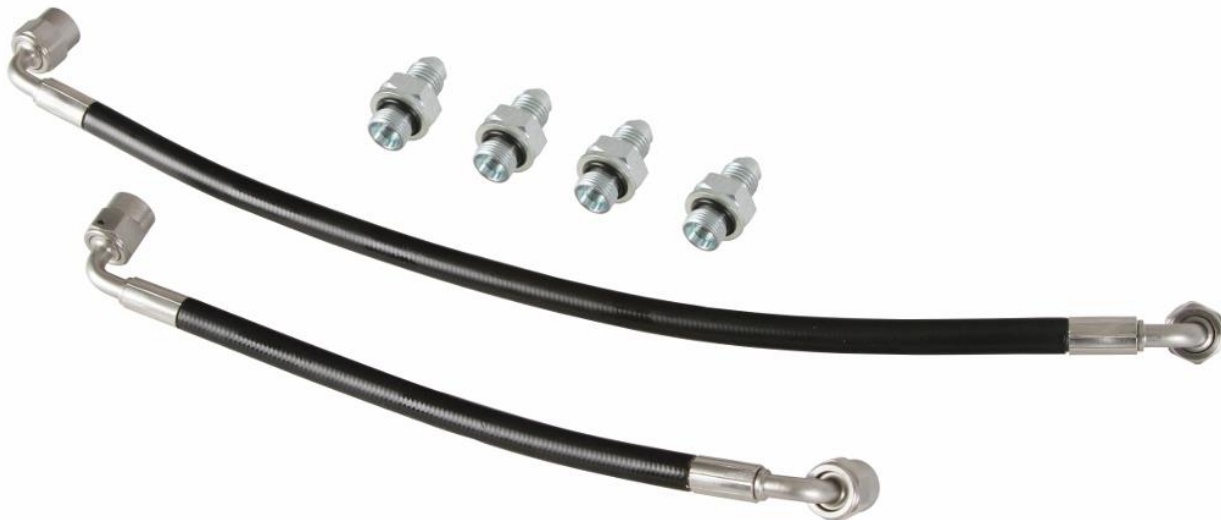
Figure 1 - P/N: 091307DS shown

The DSE rack & pinion fluid transfer conversion kit will replace the hardlines on your DSE rack & pinion using -4 AN steel fittings. The hoses are Teflon lined to handle the high pressure demands of the steering system and come with pre-crimped stainless-steel fittings to attach to the -4 AN fittings.