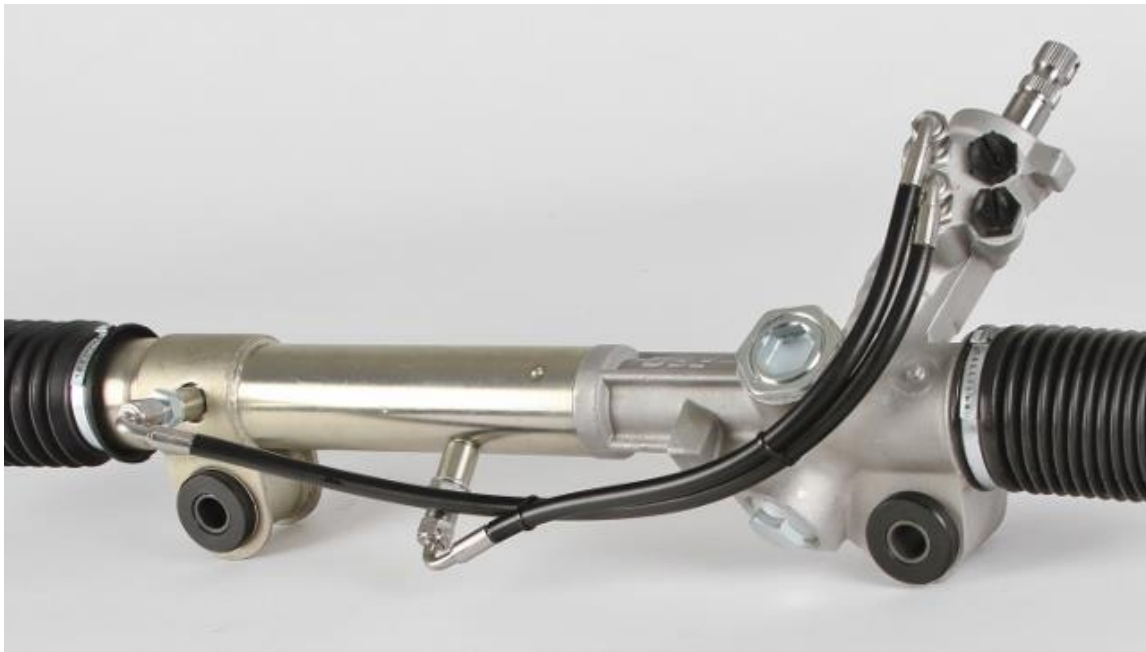
Figure 3 - Secure Fluid Transfer Hoses