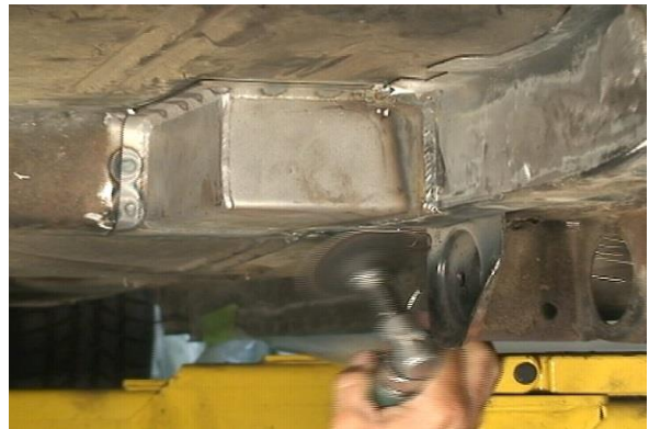
Torque Box Installation

If you have any questions before or during the installation of this product, please contact Detroit Speed at tech@detroitsspeed.com or 704.662.3272