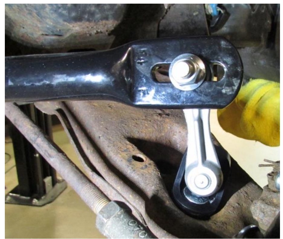
Figure 5 - Attach End Link to Sway Bar

7. There are three adjustment settings in the sway bar (Figure 6), the nominal sway bar setting would be the middle adjustment hole. When installing the end links into the sway bar, make sure the flats on the end link positively locate in the sway bar. Torque the end links to 53 lbf-ft.