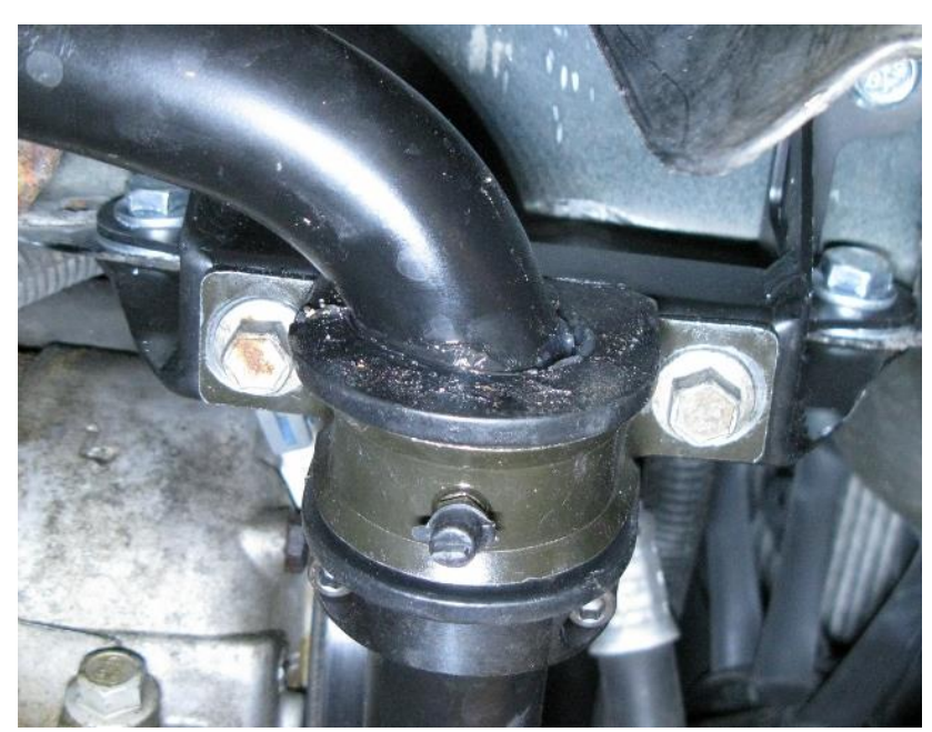
Figure 3 - Install Sway Bar

4. Position the Detroit Speed Sway Bar to the vehicle and bolt it up to the sway bar brackets using the provided M10-1.5 x 30mm flange hex bolts. Center the sway bar in the vehicle and tighten the bolts (Figure 3). Do not torque at this time.