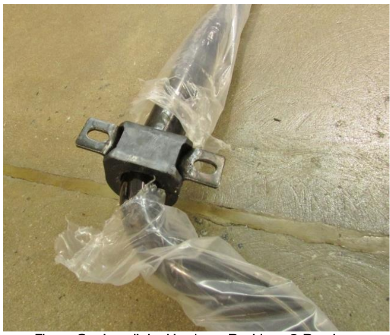
Figure 2 - Install the Urethane Bushings & Brackets

3. Install the urethane bushings on the sway bar using the provided Super Grease. Slide the sway bar bushing brackets over the bushings. NOTE : You can leave the plastic sleeve on the bar in order to protect the powdercoat while installing the bar (Figure 2).