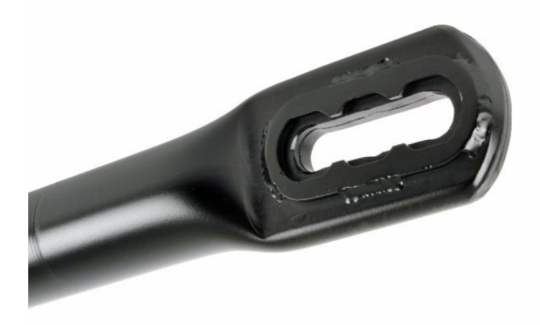
Figure 6 - Sway Bar Adjustment Holes

7. There are three adjustment settings in the sway bar (Figure 6), the nominal sway bar setting would be the middle adjustment hole. When installing the end links into the sway bar, make sure the flats on the end link positively locate in the sway bar. Torque the end links to 53 lbf-ft.