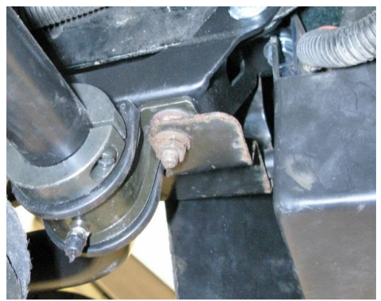
Figure 1 - Shield Attachment Stud

NOTE: If you have purchased the Detroit Speed Heavy Duty Front Sway Bar Brackets, refer to those instructions and install the brackets before installing the DSE Sway Bar.