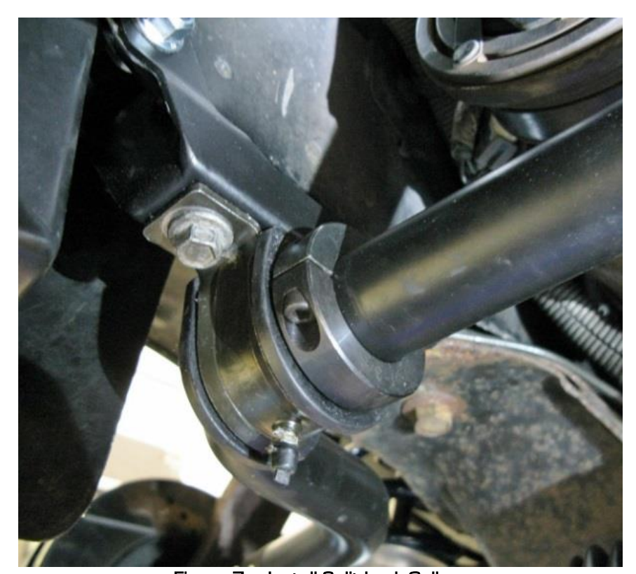
Figure 7 - Install Split Lock Collars

10. Separate the split lock collars into two pieces and place them around the sway bar to the inside of the sway bar bushings. Reassemble the collars using medium strength blue Loctite 242 on the bolts and torque to 15 lbf-ft (Figure 7). NOTE: Position the collars tight to the urethanes bushings when installing.