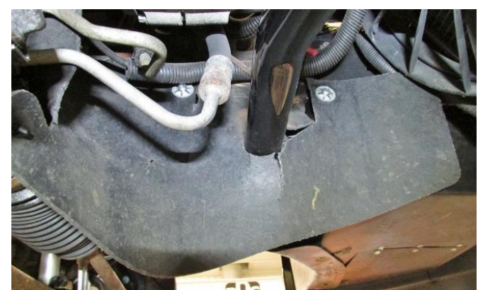
Figure 8 - Re-Install Splash Shield

12. Torque the lug nuts to the recommended factory specifications. The installation in now complete.