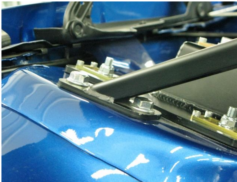
Figure 3 - Install M10 Fasteners