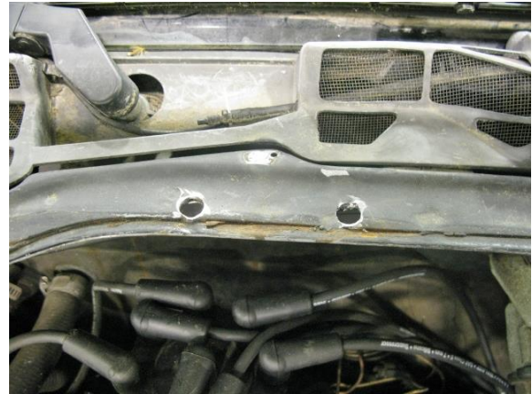
Figure 2 - Drill Mounting Holes