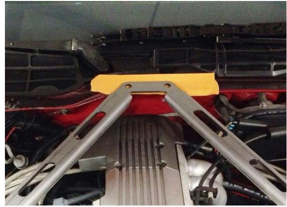
Figure 1 - Locate the Strut Tower Brace