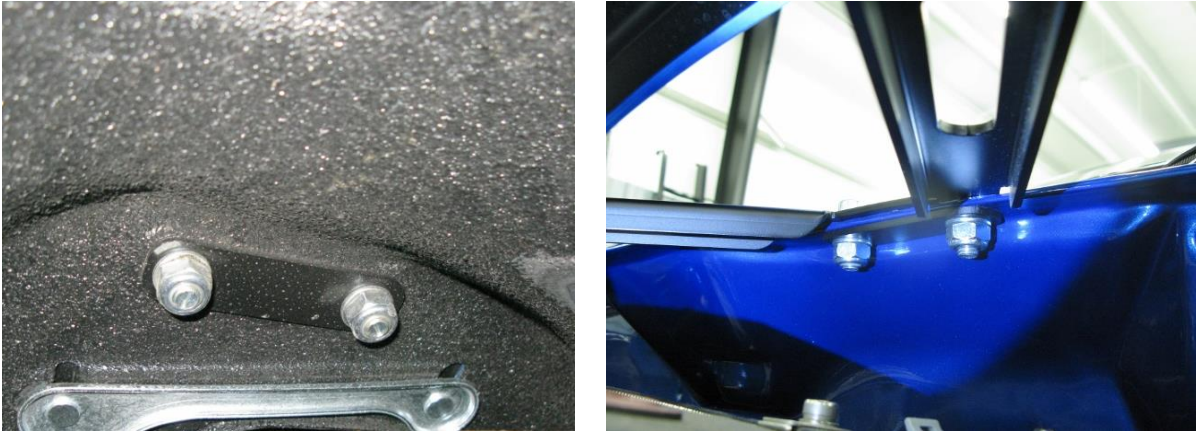
Figure 4 - Install Doubler Plates