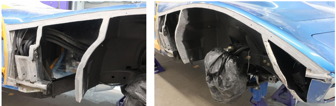
Figure 1a – Remove Front Factory Fender Flares