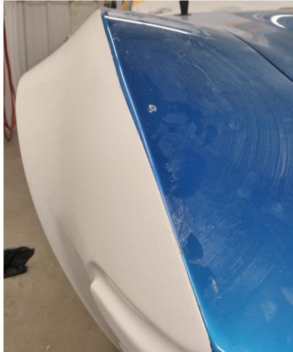
Figure 2b - Fit Detroit Speed Front Fender Flares