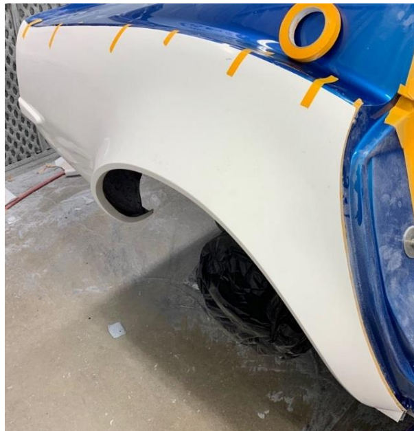
Figure 2c - Fit the Detroit Speed Rear Fender Flares