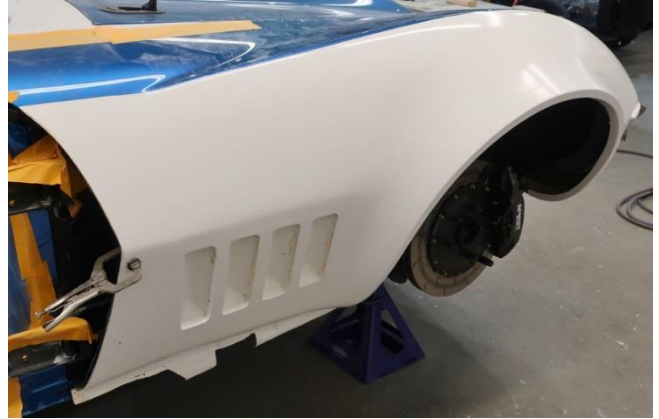
Figure 2a - Fit Detroit Speed Front Fender Flares