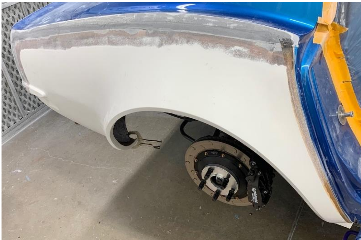
Figure 3 – Fiberglass the Fender Flare to the Body