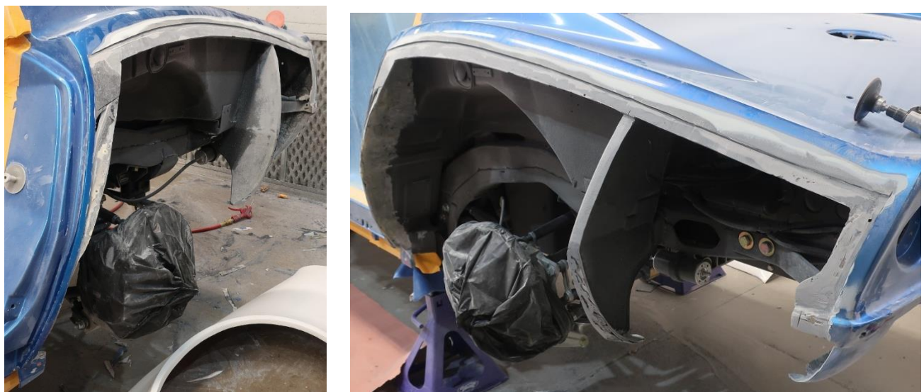
Figure 1b – Remove Rear Factory Fender Flares