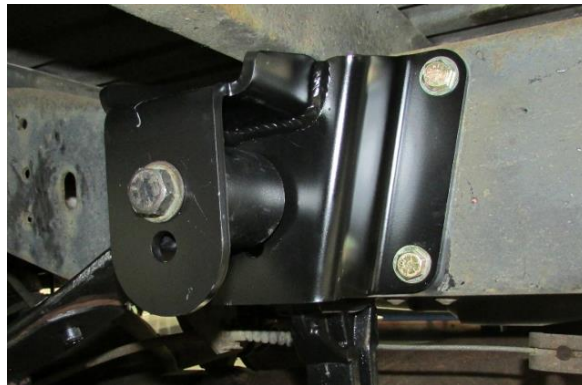
Figure 4 - Install Leaf Spring

NOTE: If you are not using a flip kit, we recommend using the top mounting hole for maximum drop. If you are using a flip kit, we recommend using the bottom mounting hole for less drop.