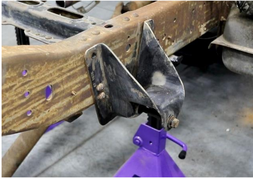
Figure 1 - Front Leaf Spring Bracket