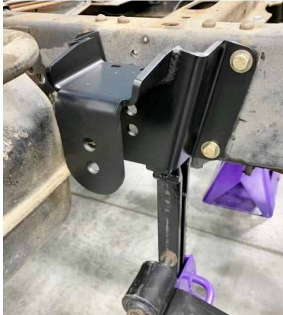
Figure 3 - Install Drop Hanger