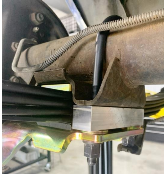
Figure 1 – Add Washers if Needed

NOTE: If you are not using the Detroit Speed drop leaf springs that are not as thick at the spring perch, you may need to use the rubber pad(s) removed in step 1 if the assembly is not tight after installation.