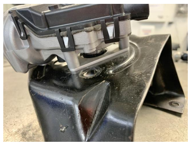
Figure 14 - Drill Motor Mount Holes

20.Locate the new wiper motor assembly to the factory mounting bracket with the wiper motor spacer in between the wiper motor and the mounting bracket (Figure 14).