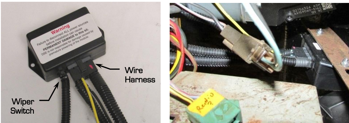
Figure 23 - Connect Wiper Switch & Harness to Module

30.Install the 10-pin connector of the wiring harness into the wiper control module located on the dash support bracket. Install the 4-pin connector from the wiper switch and install it into the control module (Figure 23).