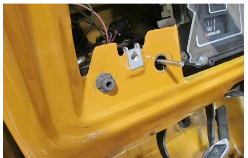
Figure 7 - Install DSE Switch & Bracket

9. Postion the DSE wiper switch and bracket behind the dash. Install the wiper switch shaft through the wiper switch hole in the dash. Re-install the headlight switch to the DSE switch bracket and install the headlight switch nut throught the dash and into the headlight switch to hold it in place (Figure 7).