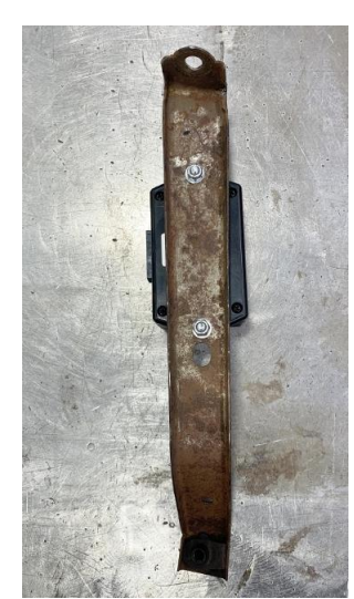
Figure 20 - Mount the Control Module

27.Re-install the dash support bracket with the wiper control module back under that dash (Figure 21).