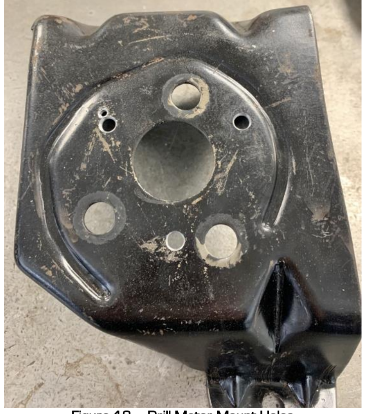
Figure 13 - Drill Motor Mount Holes

19.Drill three small holes that were transferred from the spacer with a 17/64" drill bit through the mounting bracket (Figure 13).