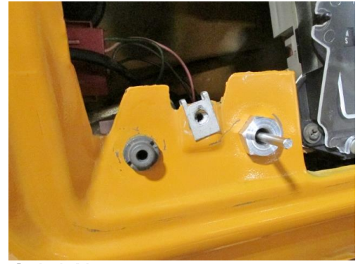
Figure 8 - Install DSE Wiper Switch Nut