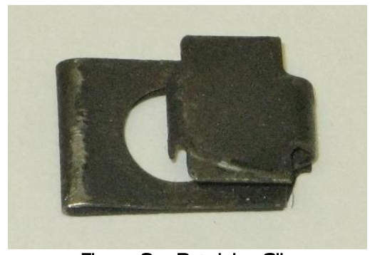
Figure 9 - Retaining Clip