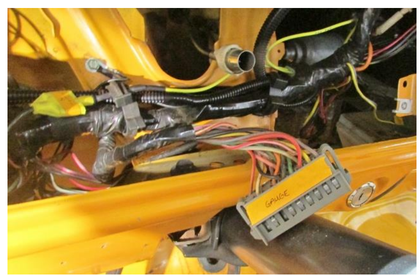
Figure 3 - Remove Gauge Cluster

4. Remove the speedometer cable and disconnect the wiring harness from the back of the gauge cluster. Remove the gauge cluster from the dash (Figure 3). Remove the heater controls and radio from the dash.