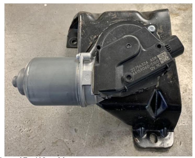
Figure 15 - Wiper Motor

22.Install DSE wiper motor and bracket to the firewall under the dash using the three factory screws (Figure 16).