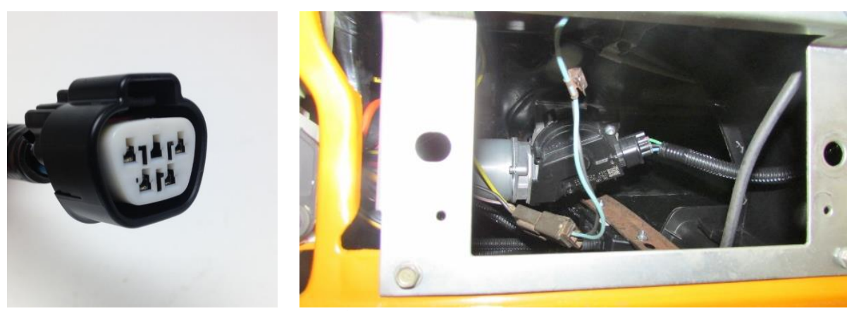
Figure 18 - Wiper Motor Connector

24.Install the wiper motor connector side of the wiring harness into the wiper motor (Figure 18).