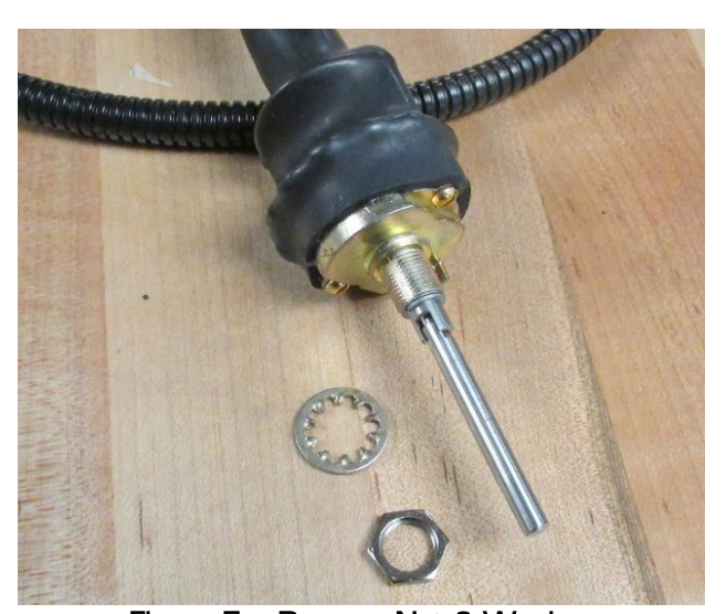
Figure 5 - Remove Nut & Washer

8. Place the switch into the DSE switch bracket making sure the anti-rotation tab lines up with the small hole in the bracket (Figure 6).