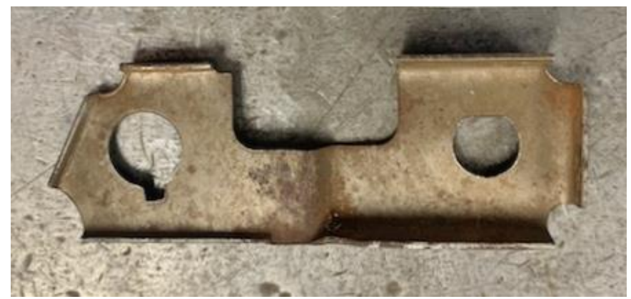
Figure 4 - Remove Factory Switch Bracket

5. Remove the factory headlight and wiper switch bracket from behind the dash by removing the switch nuts on the front side of the dash (Figure 4).