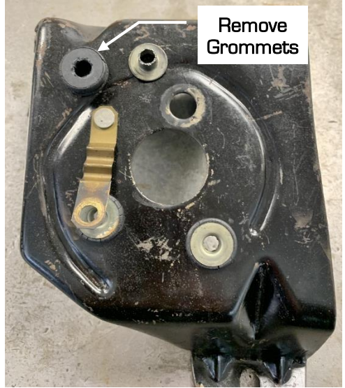
Figure 10 - Remove Motor & Grommets

17.Clamp the provided DSE wiper motor spacer on the mounting bracket so the large center hole lines up with the center hole in the bracket. Align one side of the spacer so it is parallel with the top edge of the mounting bracket (Figure 11).