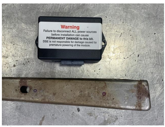
Figure 19 - Position the Wiper Control Module