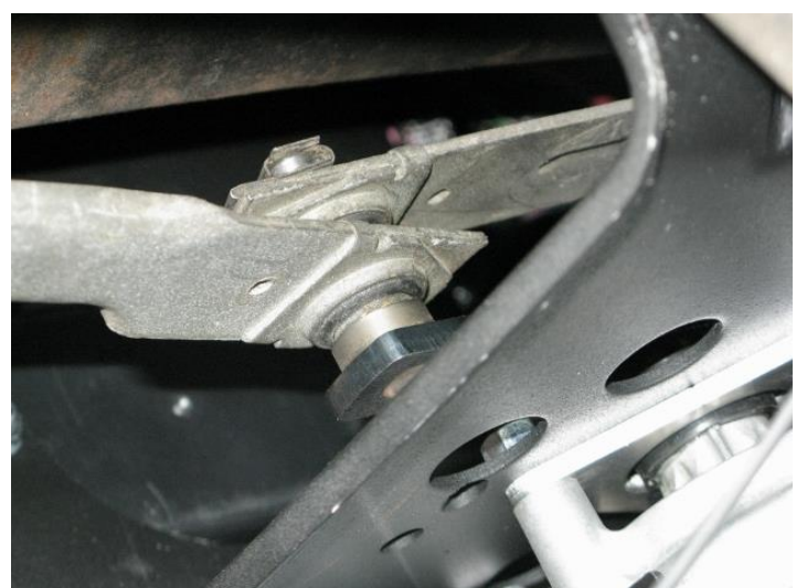
Figure 17 - Attach Wiper Linkage to Pitman Arm

23. Attach the new DSE wiper motor pitman arm to the original wiper linkage using the factory retaining clip (Figure 17). NOTE: The Selecta-Speed wiper kit is shipped with the pitman arm in the "parked" position. Do not move the pitman arm by hand to attach the wiper linkage. If the pitman arm is moved from the original "parked" position from Detroit Speed, it may result in the wiper blades stopping in the wrong spot on the windshield.