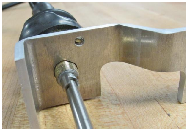
Figure 6 - Switch Bracket