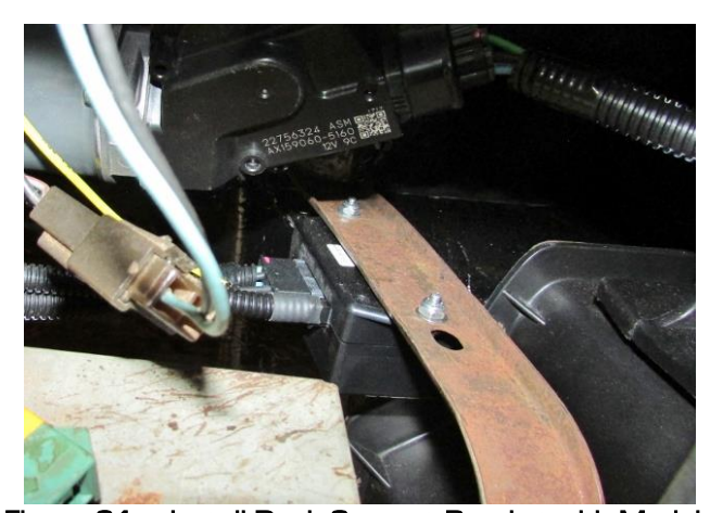
Figure 21 - Install Dash Support Bracket with Module

27.Re-install the dash support bracket with the wiper control module back under that dash (Figure 21).