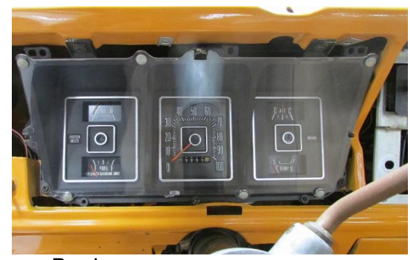
Figure 2 - Remove Bezel

4. Remove the speedometer cable and disconnect the wiring harness from the back of the gauge cluster. Remove the gauge cluster from the dash (Figure 3). Remove the heater controls and radio from the dash.