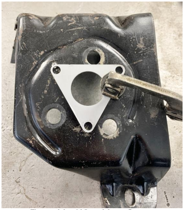
Figure 11 - Wiper Motor Spacer

17.Clamp the provided DSE wiper motor spacer on the mounting bracket so the large center hole lines up with the center hole in the bracket. Align one side of the spacer so it is parallel with the top edge of the mounting bracket (Figure 11).