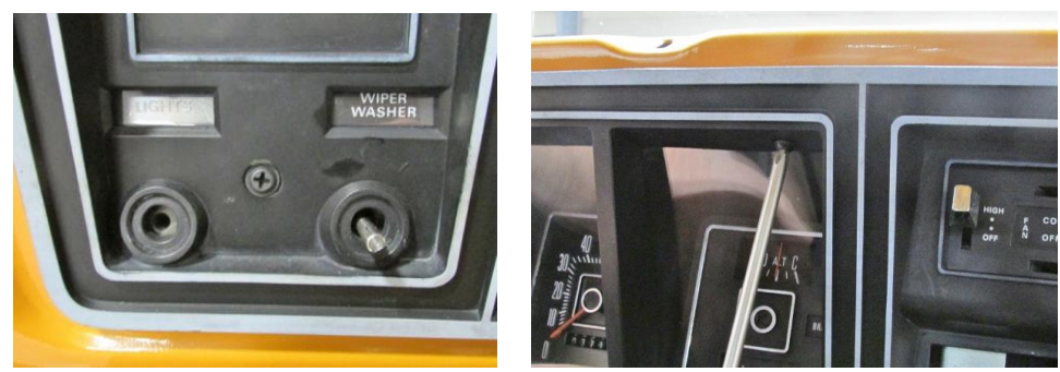
Figure 24 - Re-Install Gauge Bezel