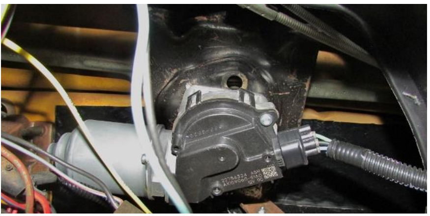
Figure 16 - Wiper Motor

22.Install DSE wiper motor and bracket to the firewall under the dash using the three factory screws (Figure 16).