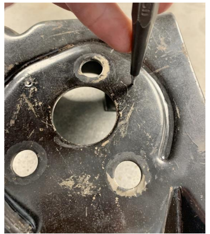
Figure 12 - Transfer Punch Bracket

19.Drill three small holes that were transferred from the spacer with a 17/64" drill bit through the mounting bracket (Figure 13).