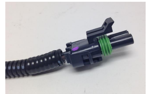
Figure 22 - Washer Pump Connection

28. The Detroit Speed Selecta-Speed harness does include a weather pack connector to install an optional electric inline washer pump into your vehicle (Figure 22). Detroit Speed does offer a washer pump kit you can purchase separately as part number 121102.