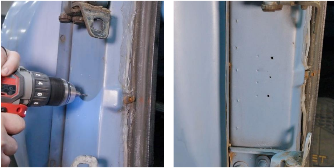
Figure 3 - Drill Hole Locations