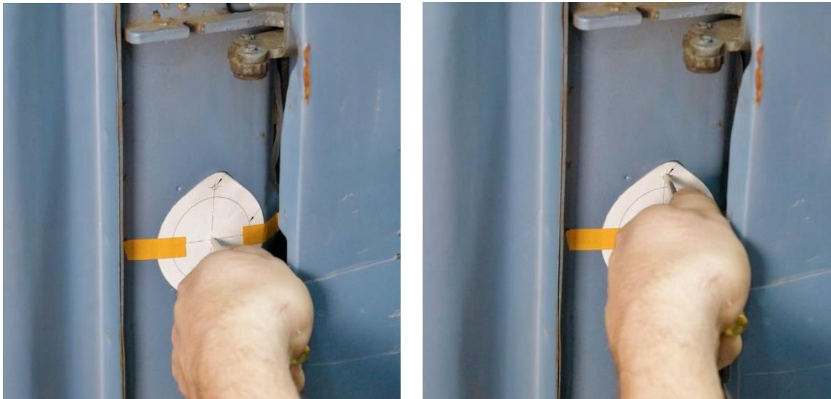
Figure 2 - Center Punch Hole Locations