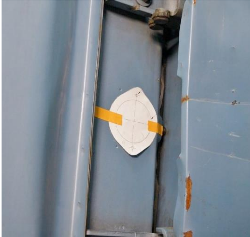
Figure 1 - Locate Template