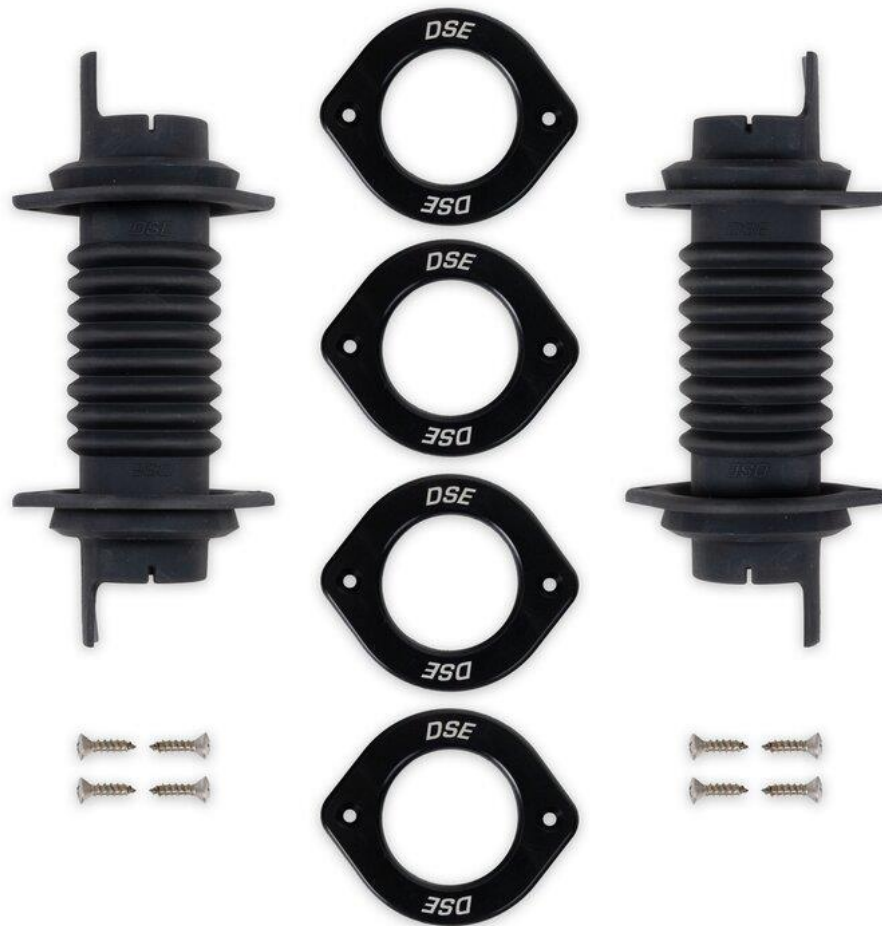
P/N: 010422DS Shown

Detroit Speed's Universal Door Jamb Wiring Boots provides an attractive solution for routing wiring in your custom car build. The EDPM rubber boots provide OE style, appearance, and wiring protection. Customize the DSE kit further by adding billet trim rings, available in machined or black anodized finish.