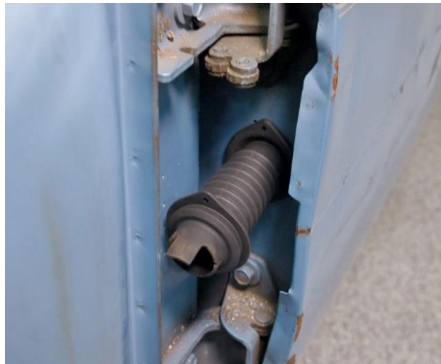
Figure 5 - Test Fit Door Jamb Boot