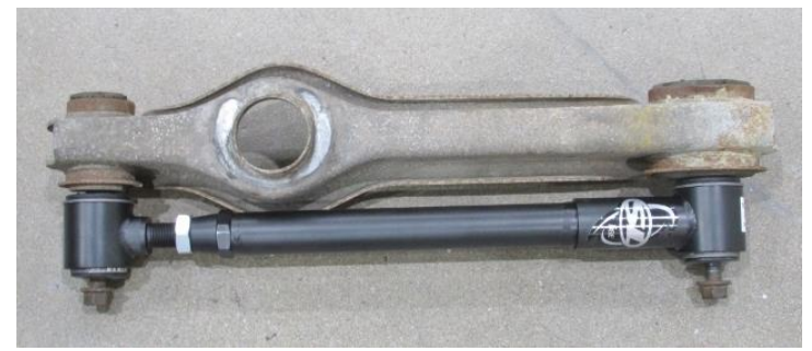
Figure 9 - Detroit Speed vs. Stock Lower Link

11. Before installing the lower Swivel-Link<sup>™</sup> assembly, adjust the link to the length of the stock arm that was removed from the vehicle if needed (Figure 9).