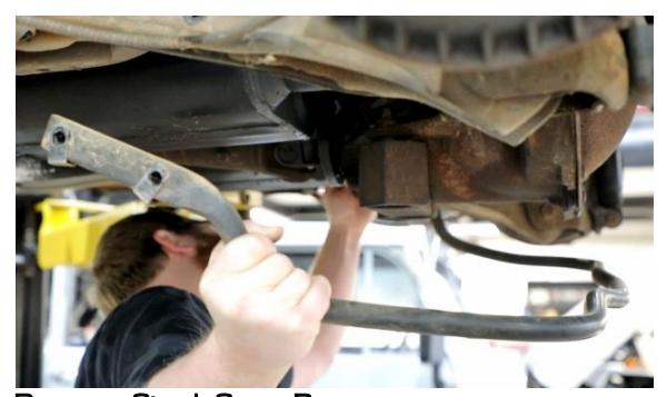
Figure 1 - Remove Stock Sway Bar

4. Place two jack stands securly under the rear axle tubes. Remove the shocks from the rear axle by removing the bolts holding the lower shock mounts in place on the rear axle brackets. Using a floor jack, raise the rear axle off the jack stands. Remove the jack stands and lower the rear axle so it is in full droop (Figure 2).