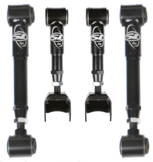
Detroit Speed Swivel-Link™ U.S. Patent Number: 7,398,984

The Detroit Speed Swivel-Link Rear Suspension Kit is a terrific way to upgrade the rear suspension on the 1979-93 Mustang or 1979-86 Capri. Detroit Speed's unique Fox Body rear trailing links incorporate our patented Swivel-Link™ system. These unique tubular trailing arms eliminate bind allowing the rear suspension to fully articulate without the use of noisy spherical rod ends. The Swivel-Link™ rear trailing links allow for easy pinion angle adjustment for improved traction and lower driveline angles. They can also be adjusted without un-bolting them from the vehicle and come powder coated black with hardware so they are ready to install.