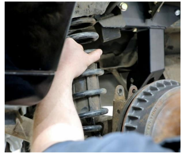
Figure 3 - Remove Springs

5. Remove the factory springs from the vehicle with the rear axle in full droop by prying them out of the lower trailing link and upper spring perch (Figure 3). CAUTION : Springs may be under tension.