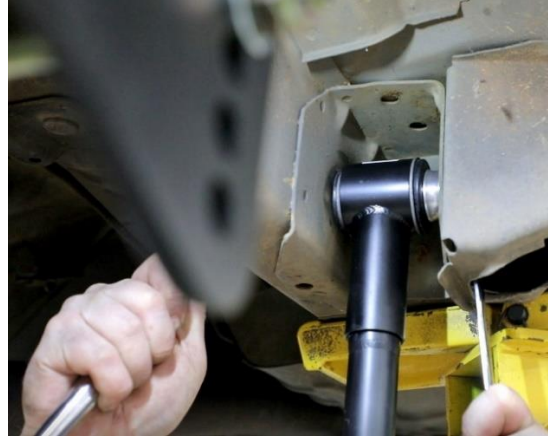
Figure 10 - Install Lower Swivel-Link™

13. Place the Swivel-Link™ into the lower axle bracket. NOTE : The Detroit Speed Rear Coilover Kit (PN: 042442) has been installed on this vehicle. Place one of the provided lower link spacers against the rear bushing on the outboard side of the Swivel-Link™ (Figure 11). Install the provided M12-1.75 hex head bolt, Nylock nut and washers. Tighten the M12-1.75 hardware however do not torque them yet as that will be completed when the vehicle is at ride height.