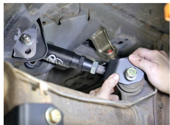
Figure 7 - Install Upper Swivel-Link™