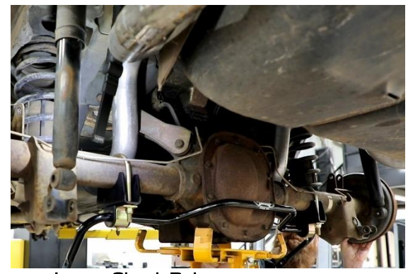
Figure 2 - Remove Lower Shock Bolts