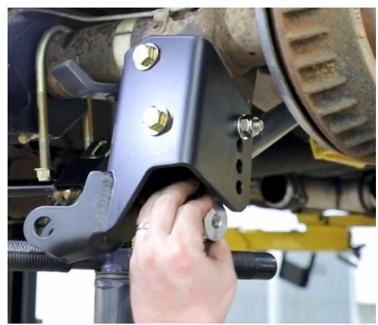
Figure 11 - Install Lower Swivel-Link™