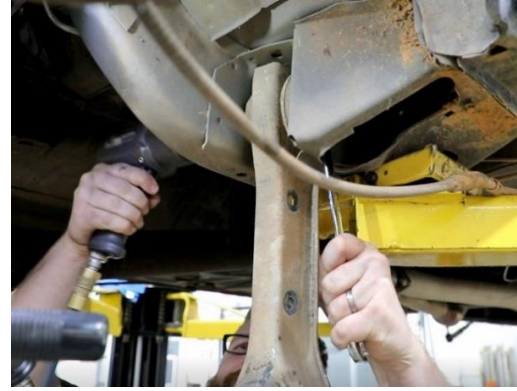
Figure 8 - Remove Factory Lower Link