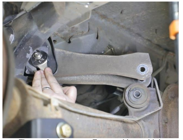
Figure 4 - Remove Factory Upper Link

6. It is recommended that the arms be replaced one at a time. Start by removing one of the upper links. Remove the upper link axle bolt first and then the body side bolt (Figure 4). CAUTION: The rear axle should be supported with jack stands under the axle tubes and one under the front of the axle at the pinion.