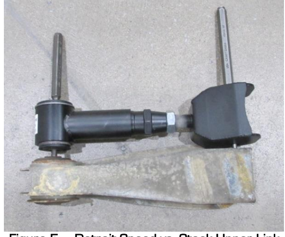
Figure 5 - Detroit Speed vs. Stock Upper Link

7. Before installing the upper Swivel-Link™ assembly, adjust the link to the length of the stock arm that was removed from the vehicle if needed (Figure 5).